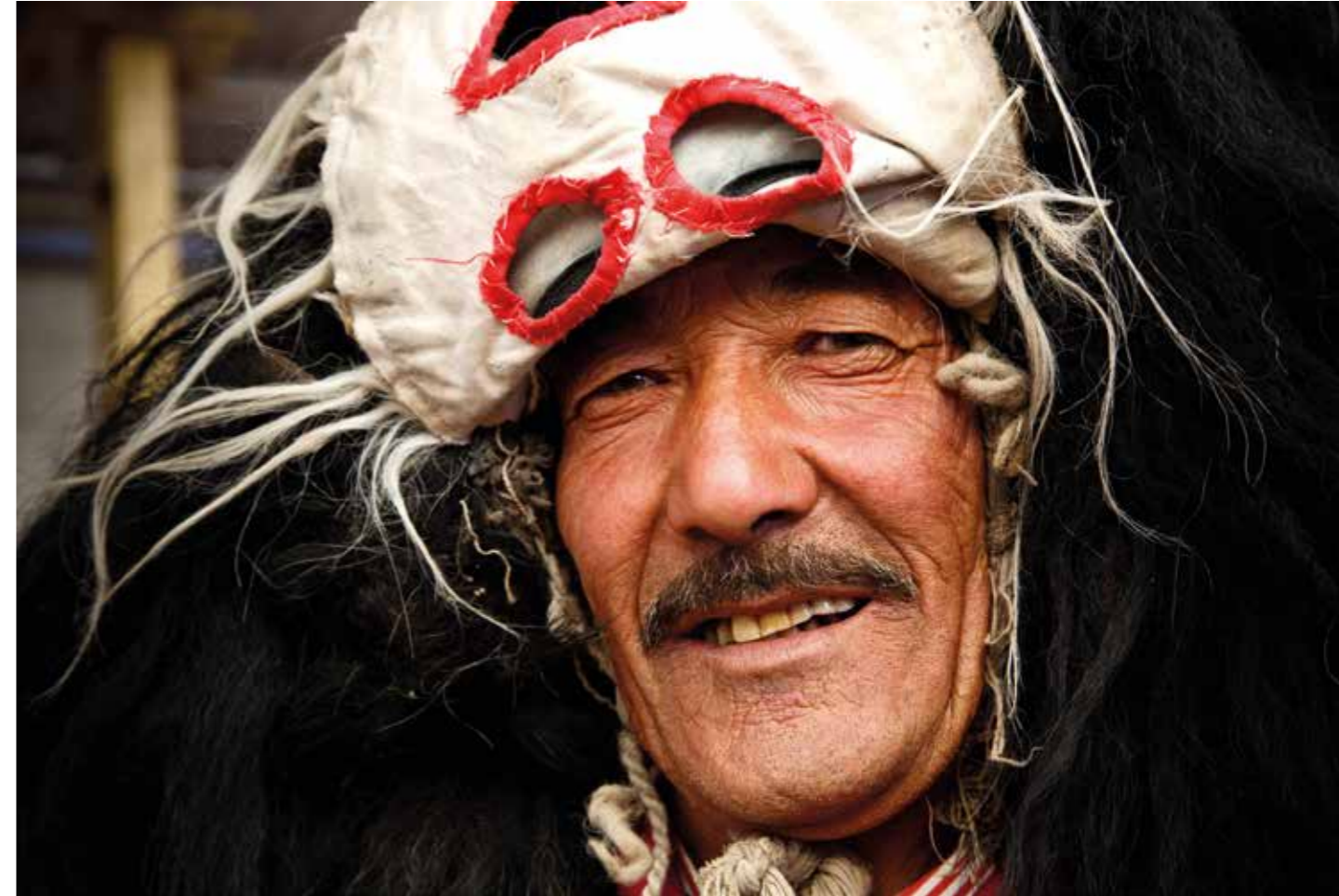
Facing page, clockwise from top left: Young children looking out on the world from their home; a Bonda tribal woman, her neck clad in layers of rings, at a weekly Thursday market near Odisha, India; a golden wedding ring is pierced through a Meghwal bride's nose; Vietnamese Ha Nhi female wears her hair styled into a distinctive large plait Above: A man in traditional costume during the annual Ladakh Festival in north India